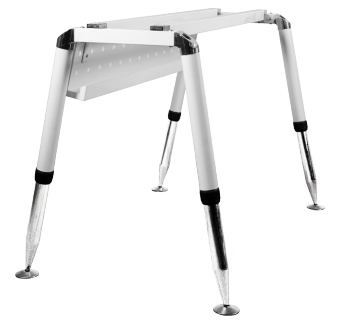
A-base, height adjustable from 710-805mm, adjusting tilted top is also possible, including modesty panel with horizontal cable tray. Finish in white/chrome or black/chrome

Natural light bamboo - Authentic, modern and representative!