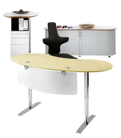
Versatile arrangements with caddy, pedestal sideboards and cabinets