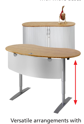
caddy, pedestal sideboards and cabinets