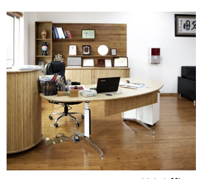
GM Office: Bamboo flooring and blind combined with coffee Bamboo desk and sideboards