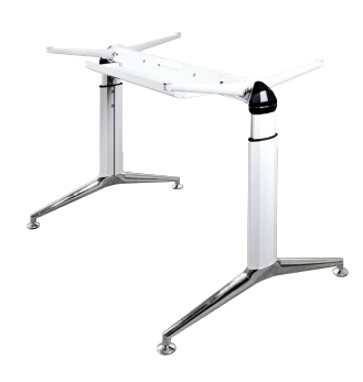
Aluminum T-base height adjustable from 720-930mm, including horizontal cable tray and vertical cable guide. Finish in white/chrome or black/chrome